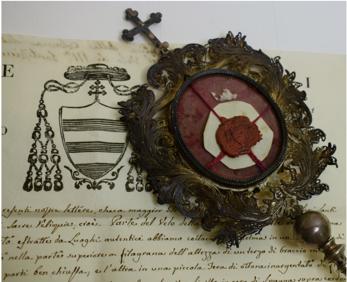
“... fitted with a crystal glass on both sides [and] closed tightly.”