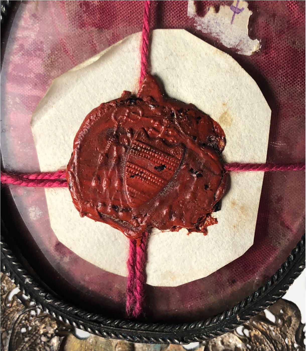
"... secured ... with our seal in Spanish wax over a pink [color] silk thread."