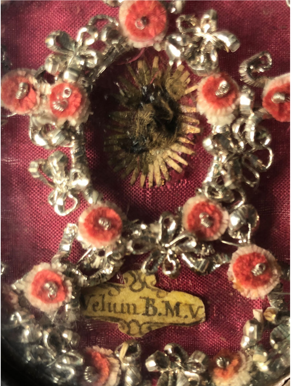
[Ex] Velum B.[eata] M.[aria] V.[irgo] (from the Veil of the Blessed Virgin Mary)