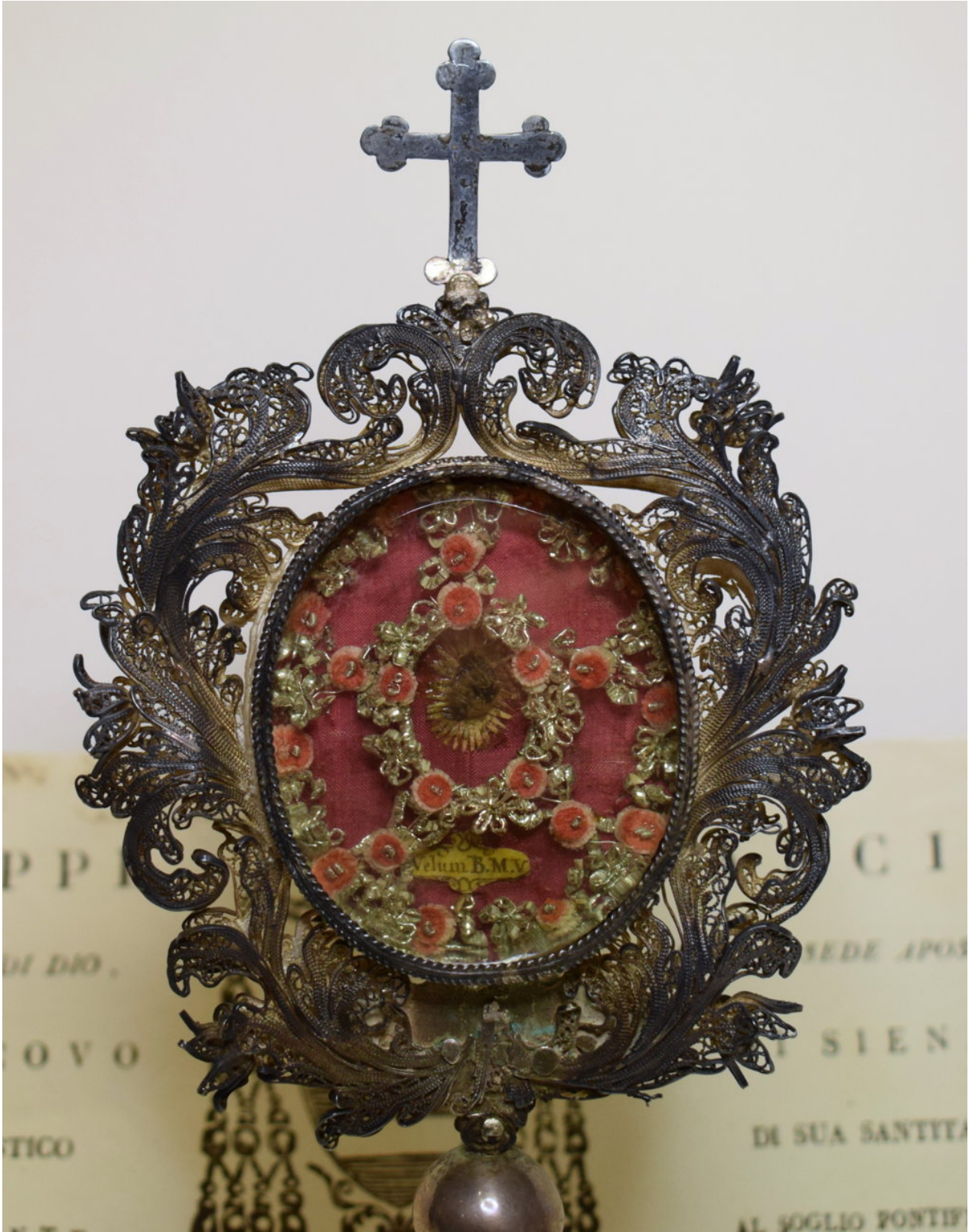
“ ... silver reliquary in the form of a monstrance, ... decorated on its upper part with filigree ... ”